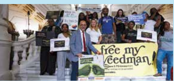
Cannabis Rally in June.