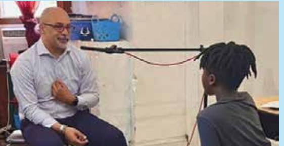
Being interviewed by a student at Jubilee School.