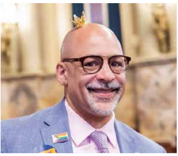
A little levity after a big win for passage of the CROWN Act prohibiting race-based hair discrimination.