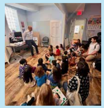
Visit in my District Office from Clover Montessori School.

The first half of 2024 has been a whirlwind of events, workshops, school visits, rallies and constituent services in and around the district. Here are just a few highlights!